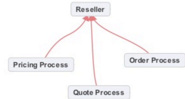
T2, T1, Reseller Overview